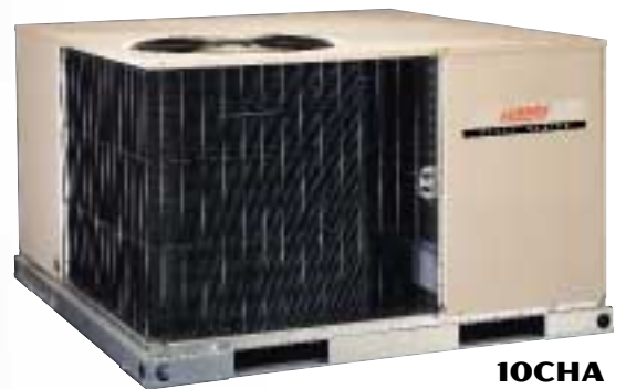
10CHA PACKAGED COOLING SYSTEM

The 10CHA packaged cooling system not only keeps you comfortable—it keeps your energy costs at a minimum. With efficiency ratings of 10.00 SEER , the 10CHA is designed to deliver more comfort for your energy dollar. Compared to older units, it can go a long way toward reducing your utility bills.