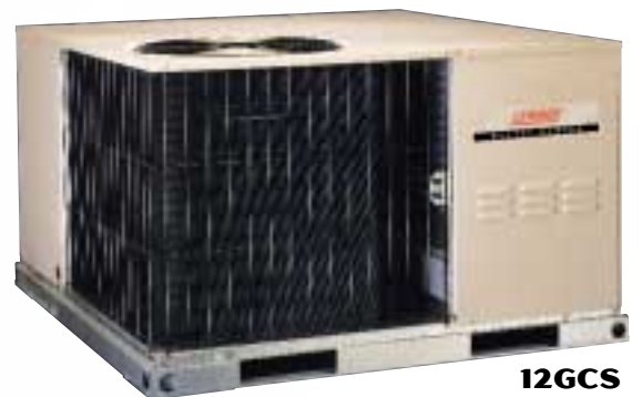
12GCS GAS/ELECTRIC PACKAGED UNIT

The 12GCS offers traditional Lennox quality, along with outstanding performance and reliability. From the dependable scroll compressor to the durable steel cabinet, this unit is built to deliver exceptional comfort—season after season, year after year.