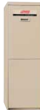
G32 GAS FURNACE

The G32 gas furnace has a dedicated low speed for continuous fan operation, which provides better air circulation, resulting in more even temperatures. This also increases the effectiveness of filters and any other indoor air quality devices you may have.