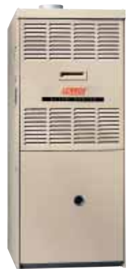
G50 GAS FURNACE

In addition to providing quiet, even heating, low-speed continuous fan operation slowly circulates air to increase the effectiveness of filters and any other air quality devices you may have.