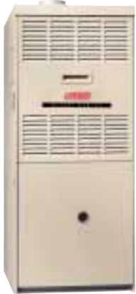
G60 GAS FURNACE WITH SILENTCOMFORT™ TECHNOLOGY