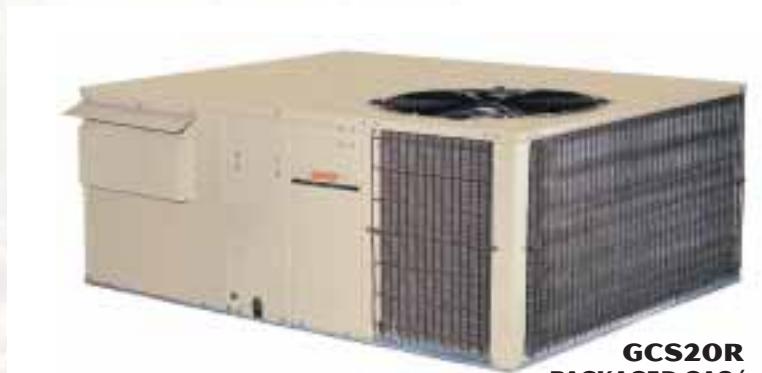
GCS20R PACKAGED GAS/ ELECTRIC UNIT